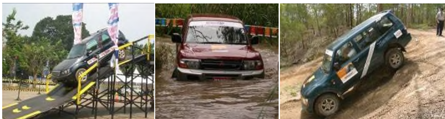
SDT Instructors providing vehicle demonstrations for car and tyre launch events